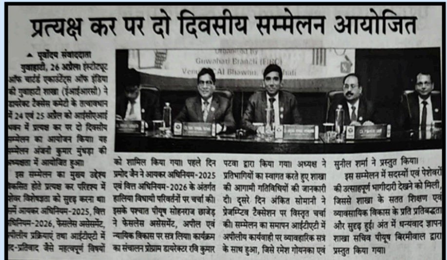
Dainik Purvoday 26.04.2026