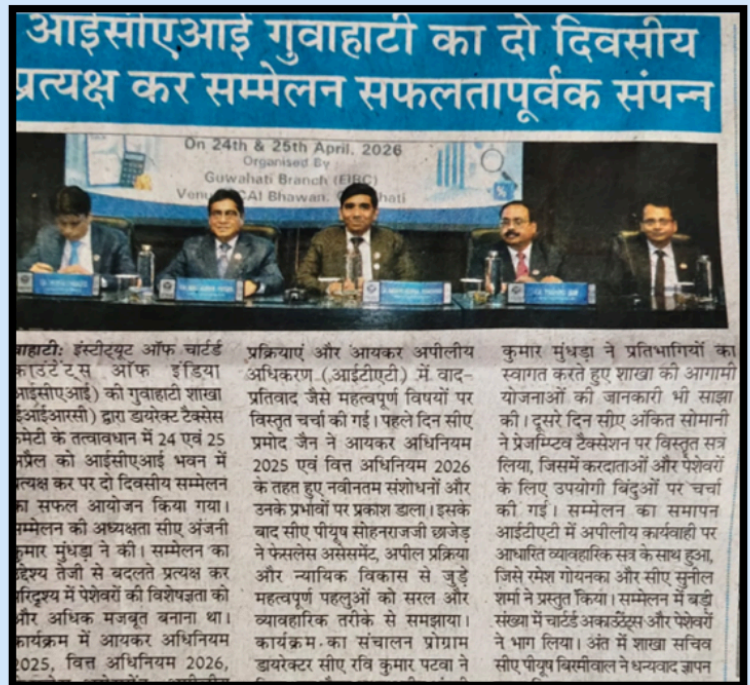
Purvanchal Prahari 26.04.2026